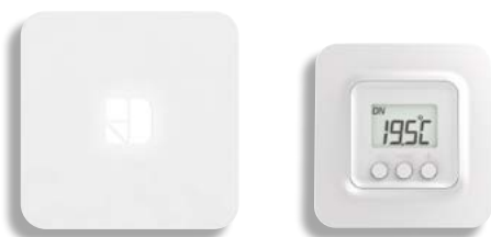
Tybox 5000 Smart pack