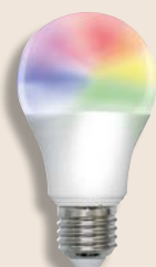
Easy Bulb E27CW