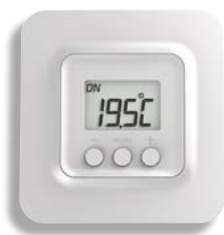
Tybox 5IOI blanc