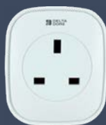
Easy Plug G13EM ref. 6353009

via the Tydom app, the Easy smart socket enables the configuration and remote control of a light or electrical appliance, and also enables consumption measurement.