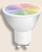
Easy Bulb GU10CW