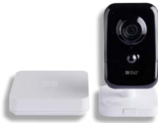
Pack Tycam 1100 indoor